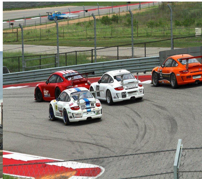
Right: a group of 4 GTC5 Cup Cars sprint to the downhill section

VIR- June 19th-21st register at clubregistration