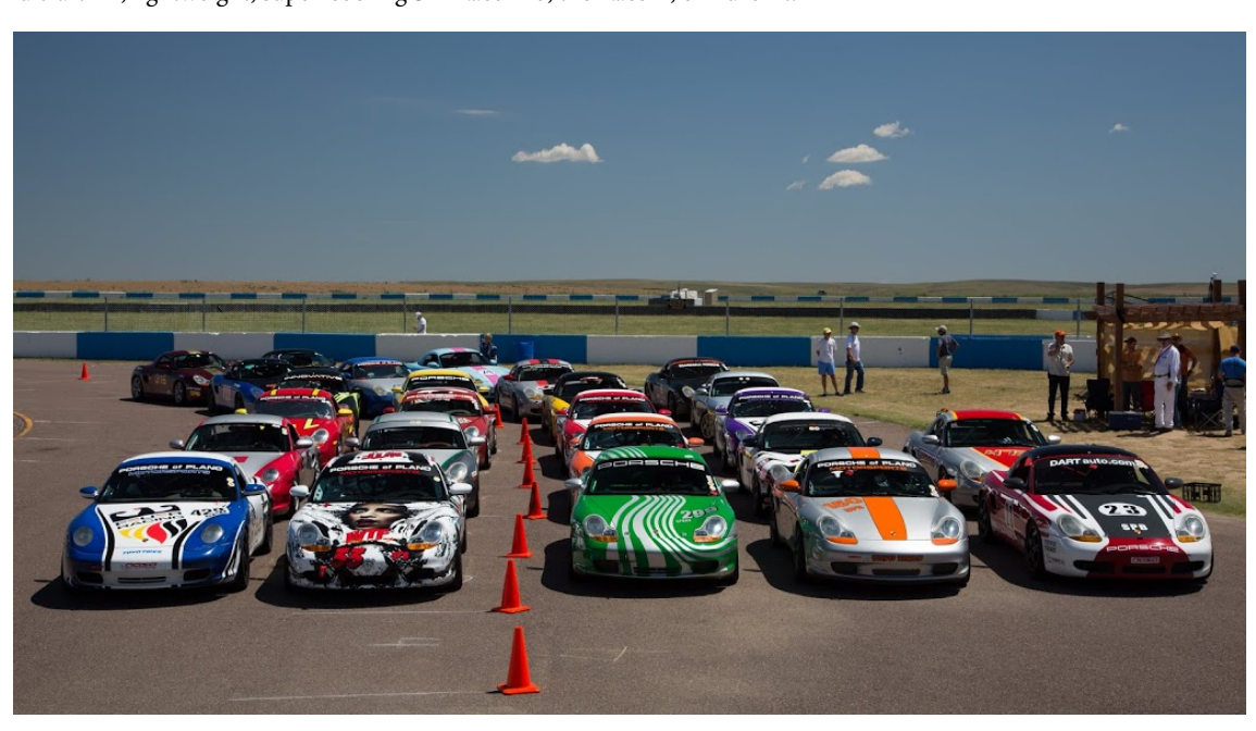
Above: A massive SPB field preparing to take on the picturesquese and challenging High Plains Raceway in August.